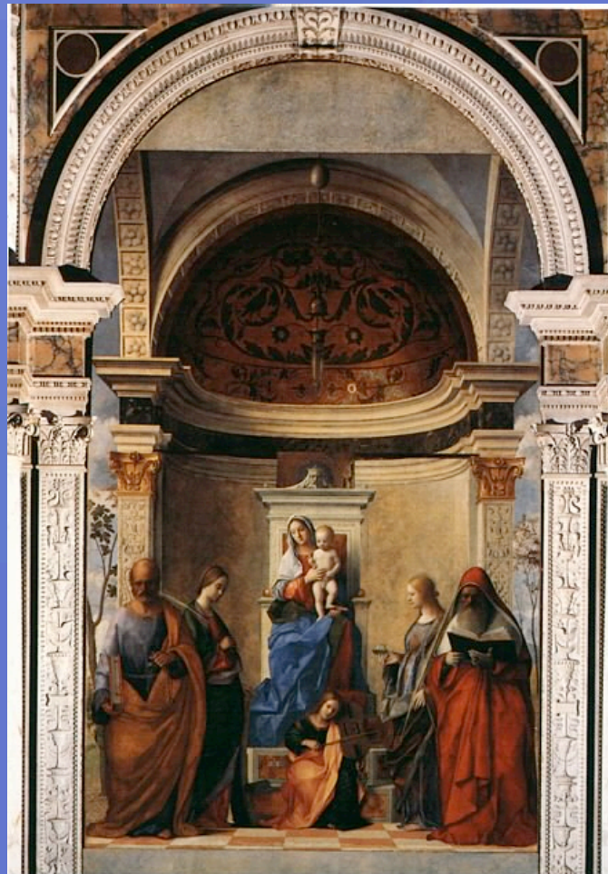
Giovanni Bellini, Sacra Conversazione