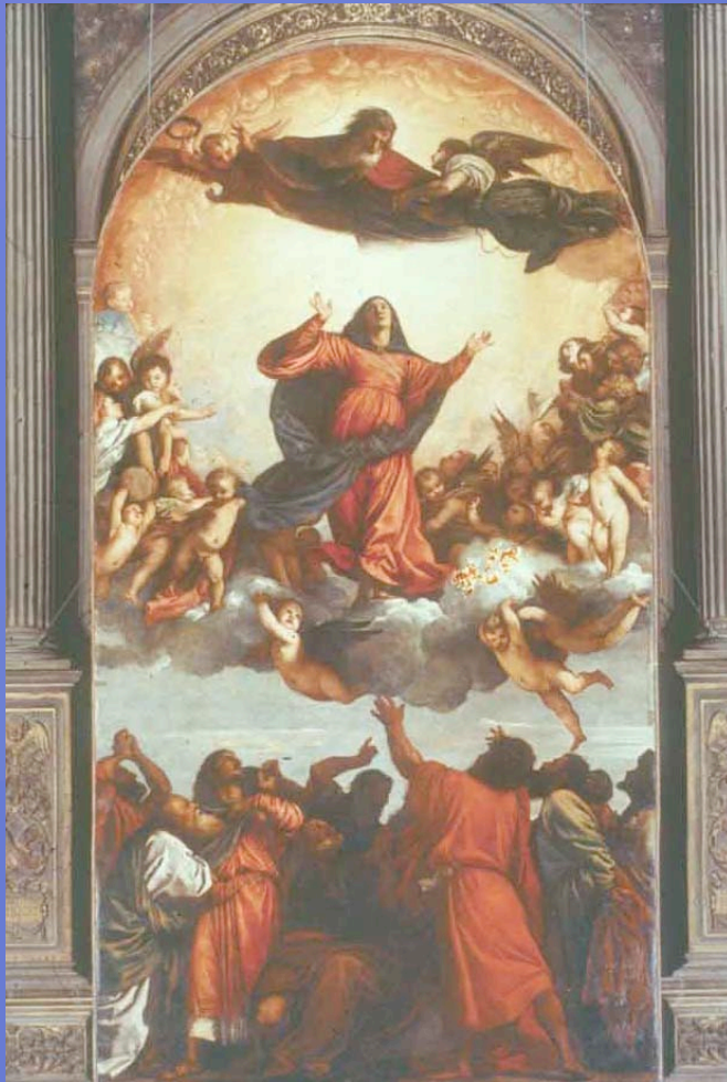
Titian, Assumption of the Virgin